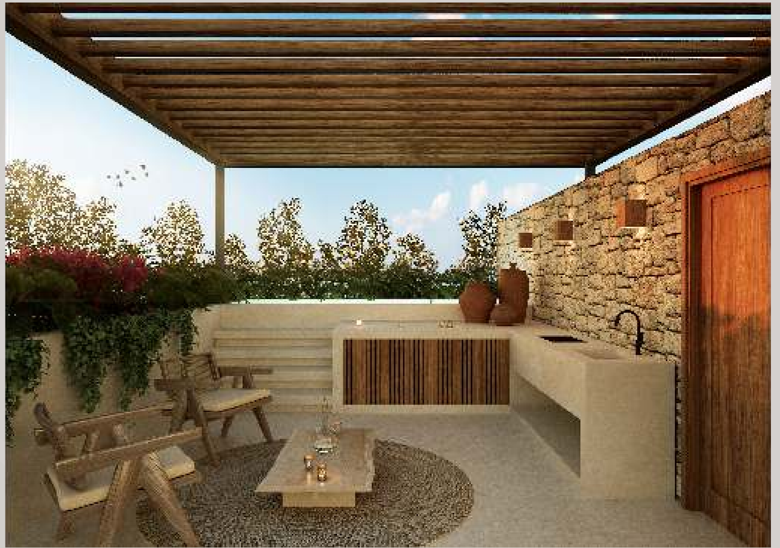
Unearth at Bacalar Residential Villas the ease of embracing and relishing an unparalleled and rapidly expanding paradise.